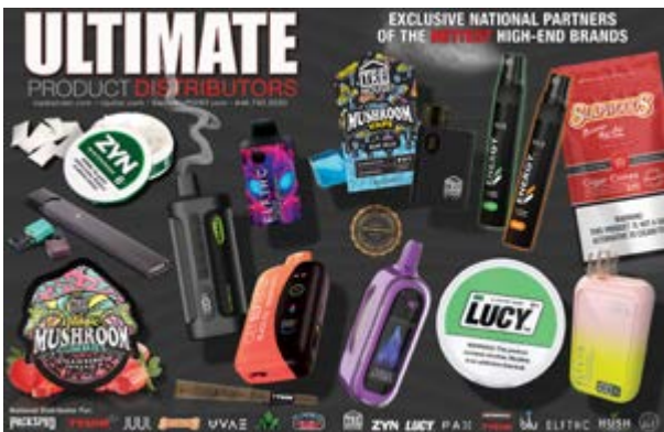
2 Page Spread

* Editorial Premium placement is right-hand placement, next to one of the following editorials: BTS, Women in Cannabis, Quest for the Best, Industry Trade Associations, Vendor Spotlight