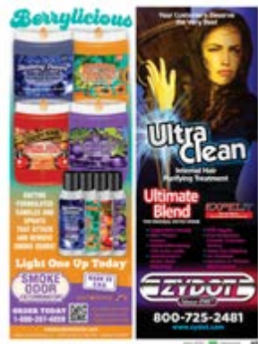
Half Page Vertical