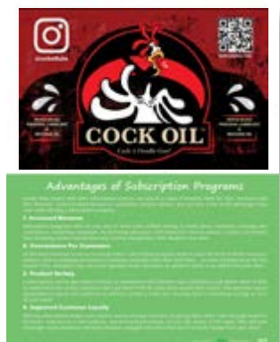
Half Page Horizontal

HQ magazine reserves the right to adjust prices. Quoted prices are not guaranteed until offered in an advertising contract.